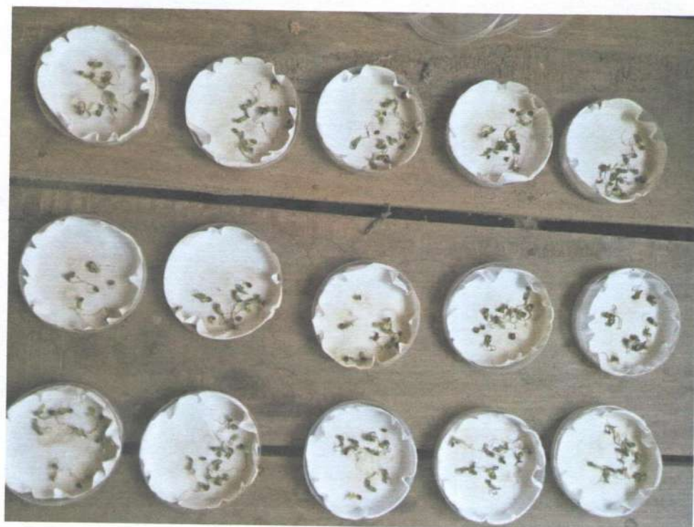
AFTER 144 HOURS