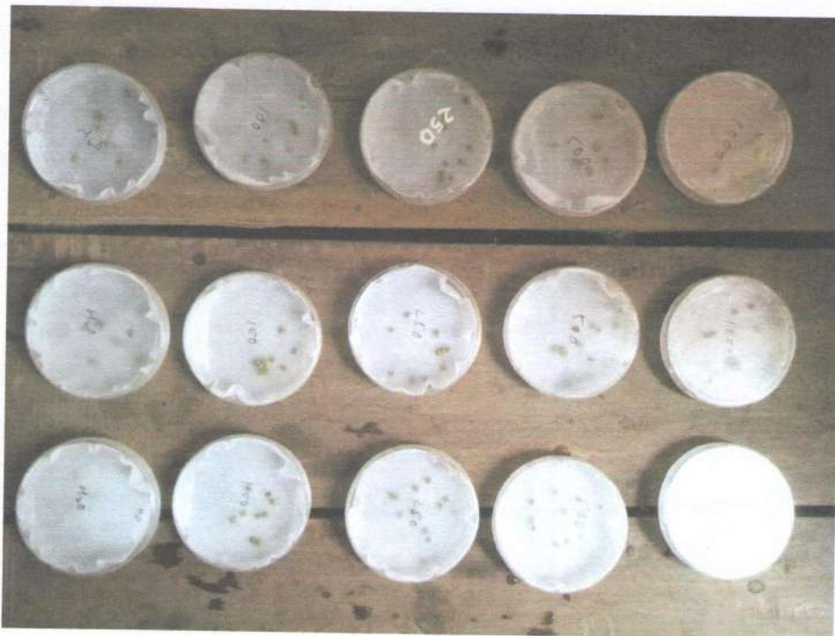
GERMINATION OF GREEN GRAM