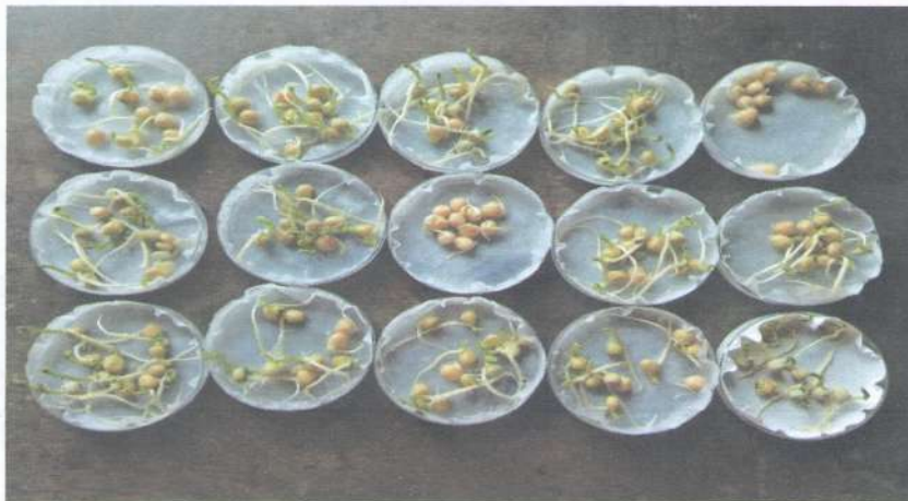
After 96 hours