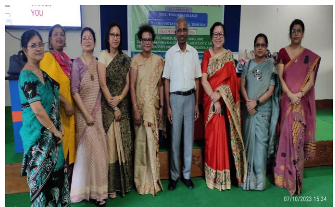
Photographs of Awareness Programme on Students' Mental and Physical Health on 7 th October 2023