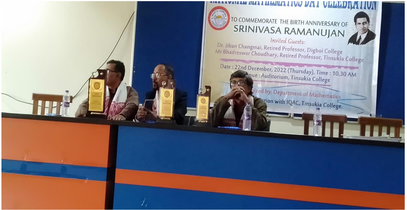
Photograph: Celebration of National Mathematics Day on 22 nd December 2022.