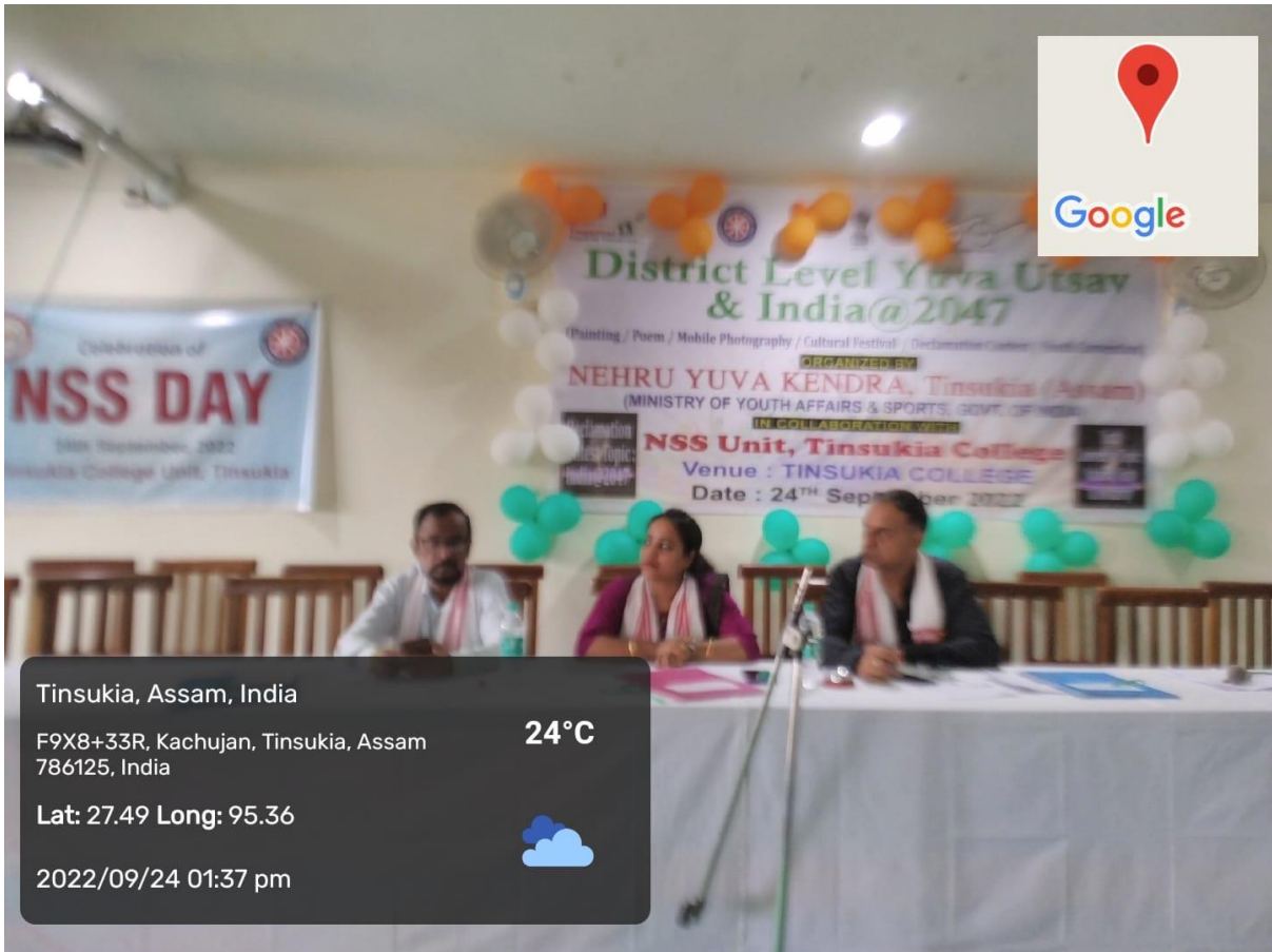
Teachers attending the programme on 24 th September, 2022