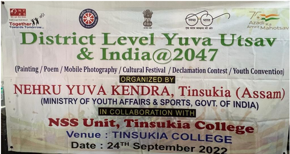
Banner of Yuva Utsav on 24 th September, 2022