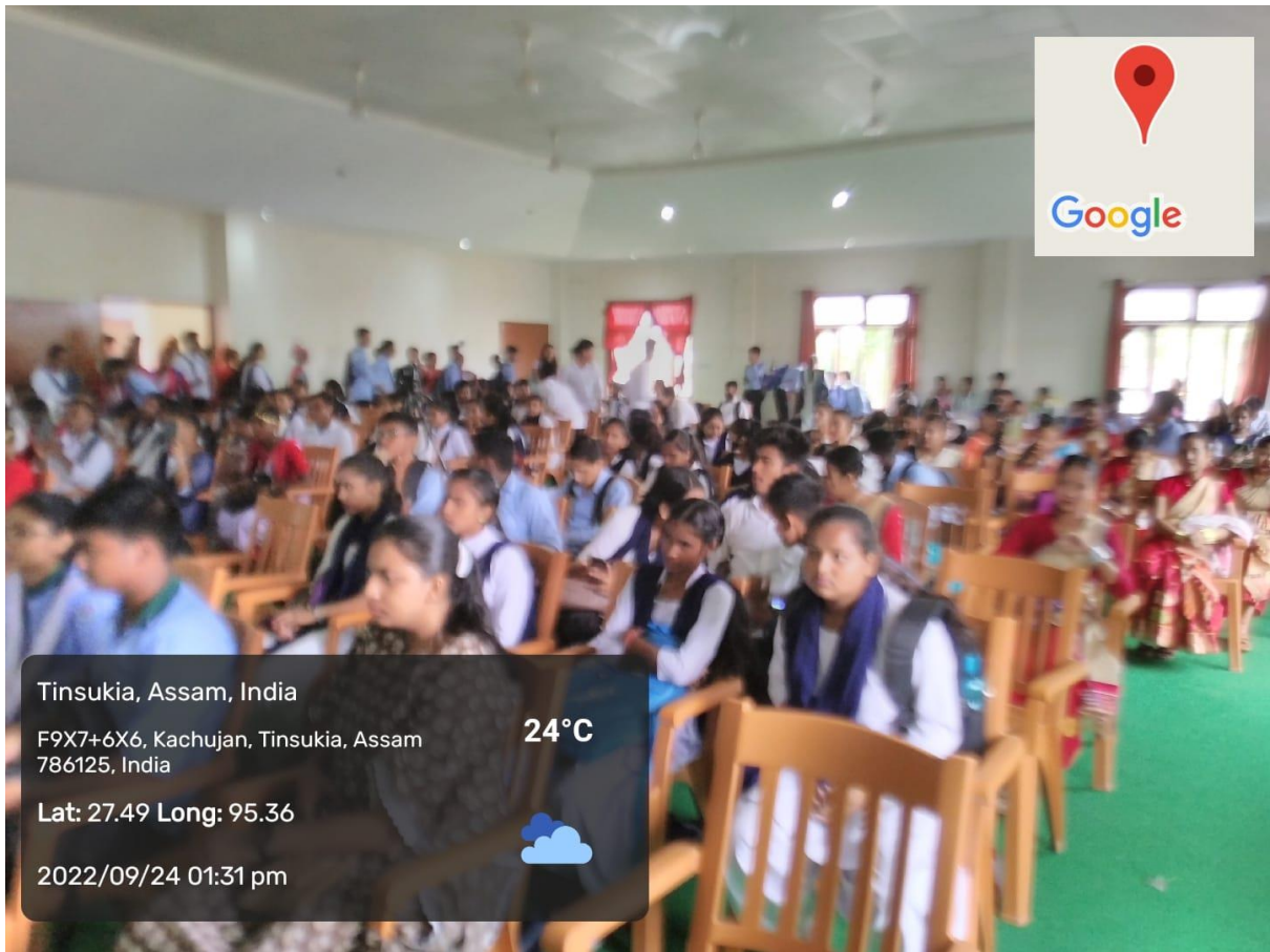
Students attending the programme on 24 th September, 2022