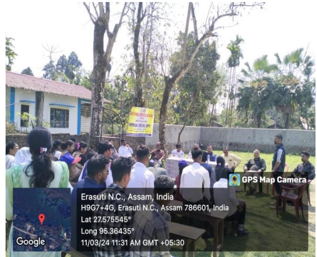
Photographs of the Annual Special Camp of NSS Tinsukia Unit at Natun Rongagora Gaon, Guujan, Tinsukia from 5 th -11 th March 2024